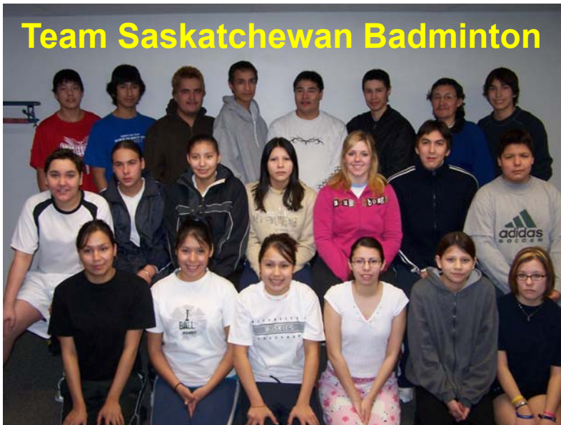
Team Saskatchewan Badminton